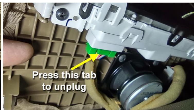
Digital Display Plug