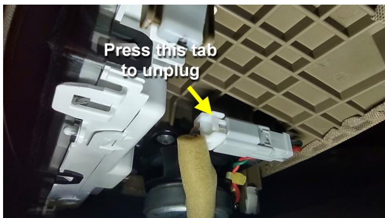
Center Speaker Plug

These photos show the 2 connectors to unplug. Squeeze the tab in the middle to release the connector. There is no harm in disconnecting these.