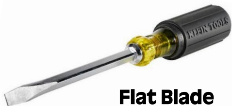
Flat Blade Screwdriver

A set of these is not required, but they're very inexpensive to buy, and come in handy for many car repair tasks. You can get these most anywhere tools are sold, hardware stores and home centers, Harbor Freight, Northern Tool, and even in many Walmarts in the tool section.